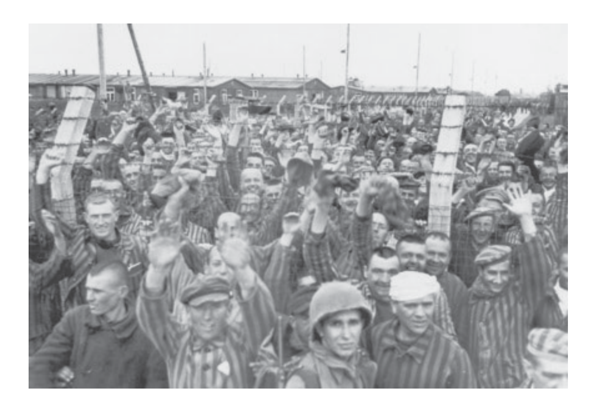
Liberation at Dachau, April 28<del>2</del>9, 1945.